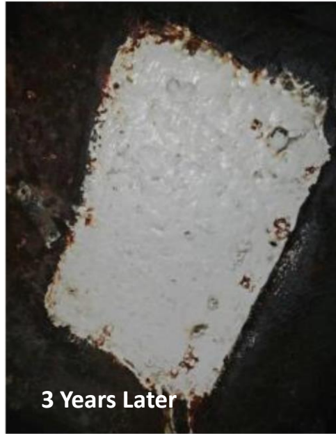
3 Years Later