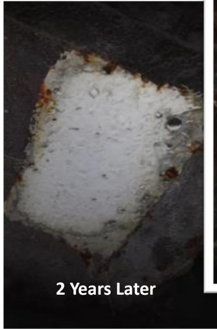
2 Years Later