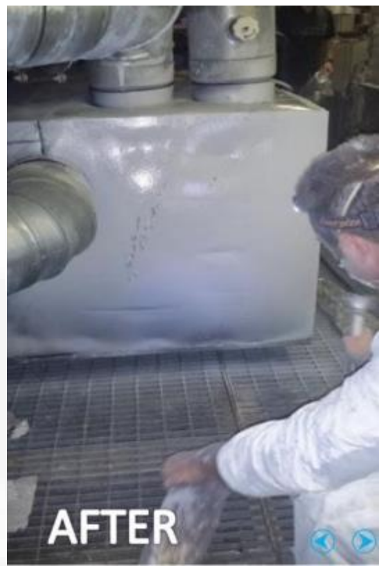
Insulated HVAC air conditioning plenum coming off air handling unit.